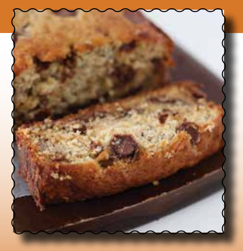
warm or at room temperature. Enjoy!

Once the bread is cooked, remove from the pan and place on a cooling rack. Serve