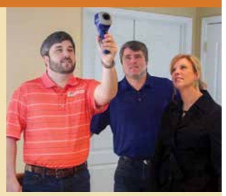
Infrared thermometers identify drafts and thermal leaks within the home.

about our rebate programs or to see if you meet the rebate requirements, visit the Save Money/Energy tab at greystonepower.com . You can also call 770-370-2070 for more info about the rebates.