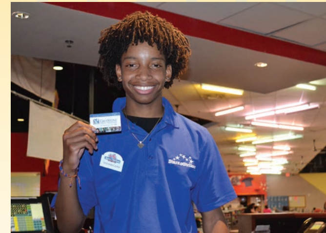
Top: Members received a free sub meal when they showed their CCC at our first Celebration Tour stop at Subway in East Point in January! Above: Let your CCC help you save on services and goods for discounts on gifts and entertainment, from businesses such as Stars and Strikes.

out-of-town discounts. Simply look for the CCC sticker in their windows, or log on to the CCC website — connections.coop/greystonepower — and check out the list of participants.