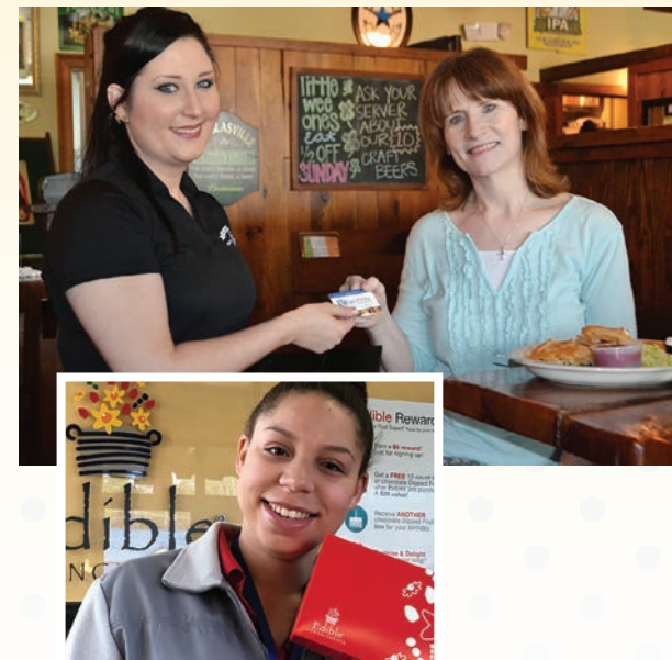
Top: The Irish Bred Pub is a proud supporter of the CCC! Above: Members can take advantage of discounts, from businesses like Edible Arrangements, by showing their CCC as they check out.

With 508 cooperatives participating in 46 states around the nation, it's even easier to use your card for