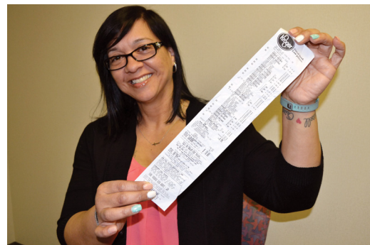
Coupons help the savings add up!

Because sales go in cycles, it's easy to stockpile items, including newly introduced products. "If I buy something