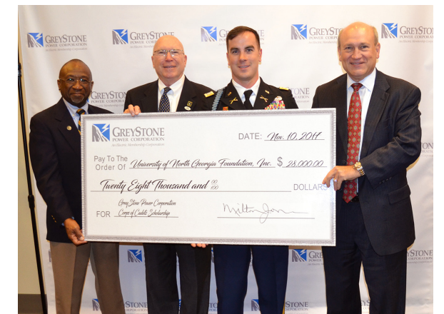
→ GreyStone leaders presented a check for $28,000 to representatives from the University of North Georgia to endow a new scholarship.

"As a responsible corporate citizen of Georgia, their partnership affirms the importance of the UNG Corps of Cadets to Georgia and the nation. We are so appreciative of their commitment and pleased to announce that they will be the presenting sponsor of the